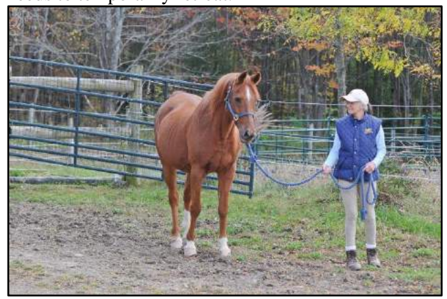
Approach is rarely linear. Horses move forward and back as they investigate. Bronzz circles

CURIOSITY is a powerful positive emotion that makes horses want to investigate. It's how their wild ancestors found food, water, and shelter. But no sane prey animal marches straight up to something suspicious, as people often expect horses to do. He wants to check it out first from a distance and ease in carefully. Many horses are anxious and spooky because they have learned to anticipate pressure to approach something too quickly. Instead, I wait with loose lead and relaxed body. I let Bronzz show me when he is ready to move forward, and when he needs to temporarily retreat.