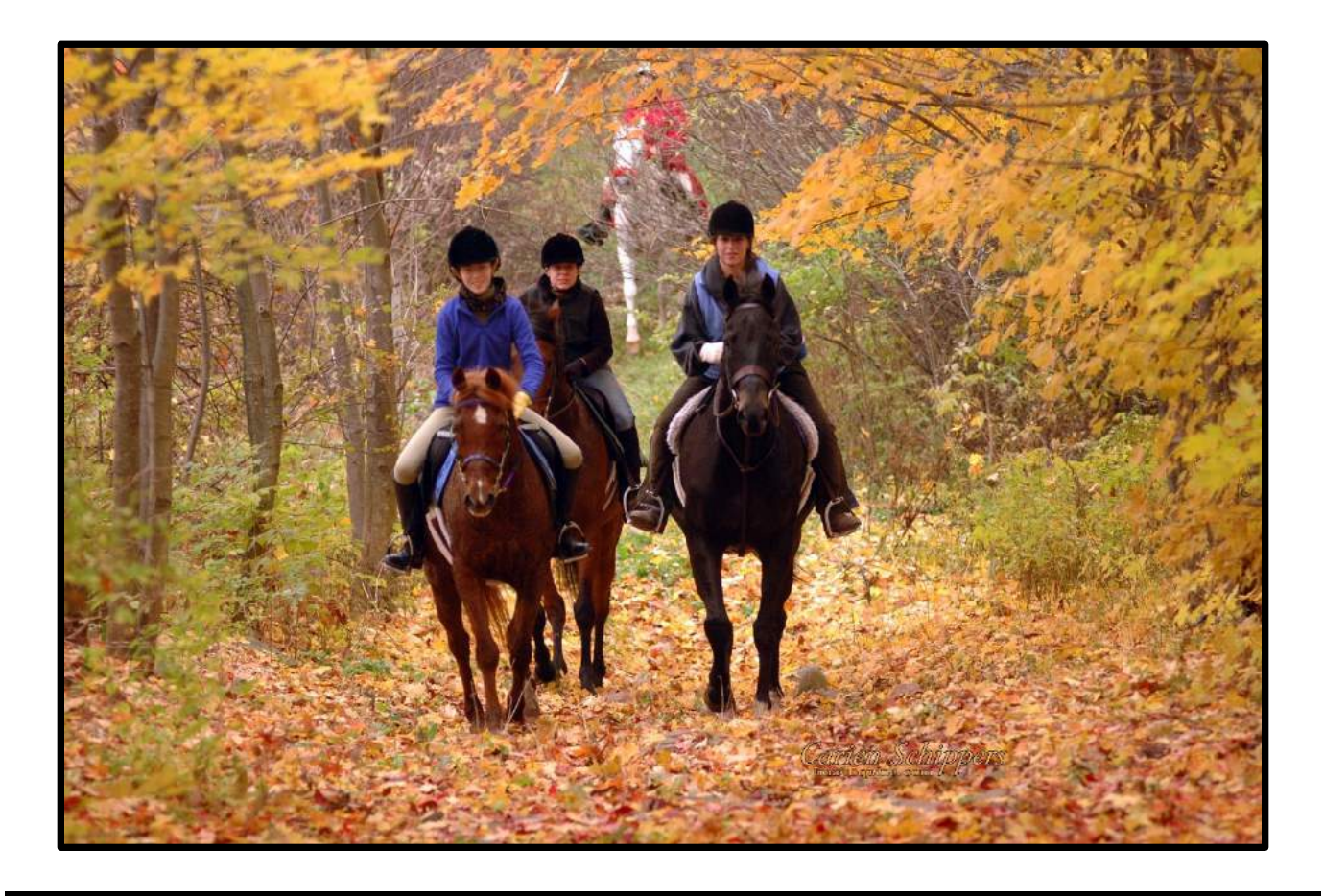
When you first start out horseback riding, it's normal to be somewhat nervous about jumping or galloping for the first time, but as you become more comfortable these might turn out to be some of your favorite activities on horseback.

Contact: Jo Lasher, Manager jolasher65@gmail.com or 518-882-1515