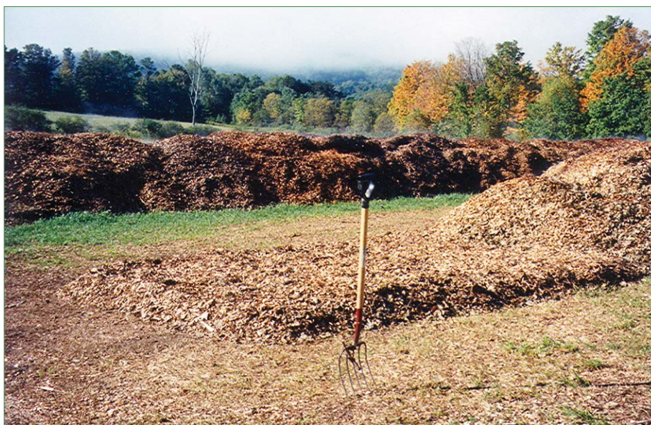
Prepared 24” wood chip compost bed.

When using or spreading the composted material, the bones can be removed and put in a hedgerow or forested land. Because they contain phosphorus and calcium, rodents will eat them; the smaller bones can be incorporated or land spread and will disappear quickly.