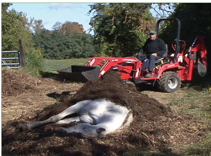
Horse being covered in woodchips.

If your horse has been euthanized with a drug such as sodium pentobarbital, care should be taken to dispose of the remains as quickly as possible. They will contain potentially harmful residues. Wildlife and domestic animals may be attracted by the carcass and become intoxicated or die if allowed to feed on it. Properly built compost piles will deter pets and wildlife from feeding on carcasses. Sodium pentobarbital has been shown to degrade during the composting process so that by the time composting is finished (within six months) very low levels of the drug remain.