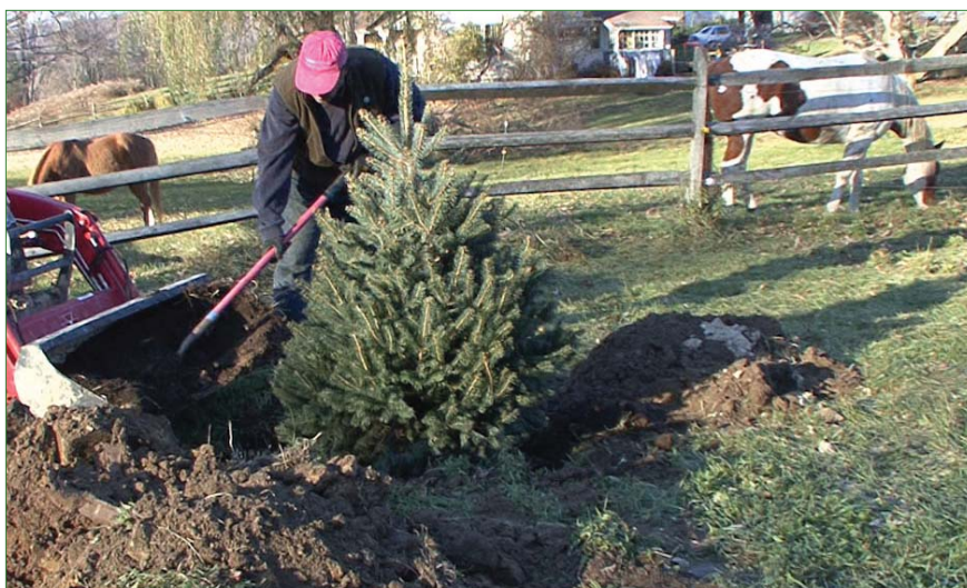
Planting a tree with compost in memory of the horse.